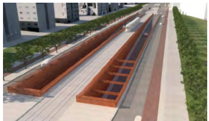
Figure 5: Helsinki – central pedestrian zone project

Recognising the importance of high-quality public space for the health and wellbeing of city residents, Helsinki’s 2021 VLR report highlights the central pedestrian zone project that will also include an underground distributor road to reduce traffic moving through the city centre. The project will expand the pedestrian zone and include cycling infrastructure, improving the central business district’s attractiveness and functionality. The aim is to develop a safe environment and to promote walking as the primary mode of transport in the city centre. While the project has been planned since 2019, it was finally approved by the Helsinki City Council in 2021.