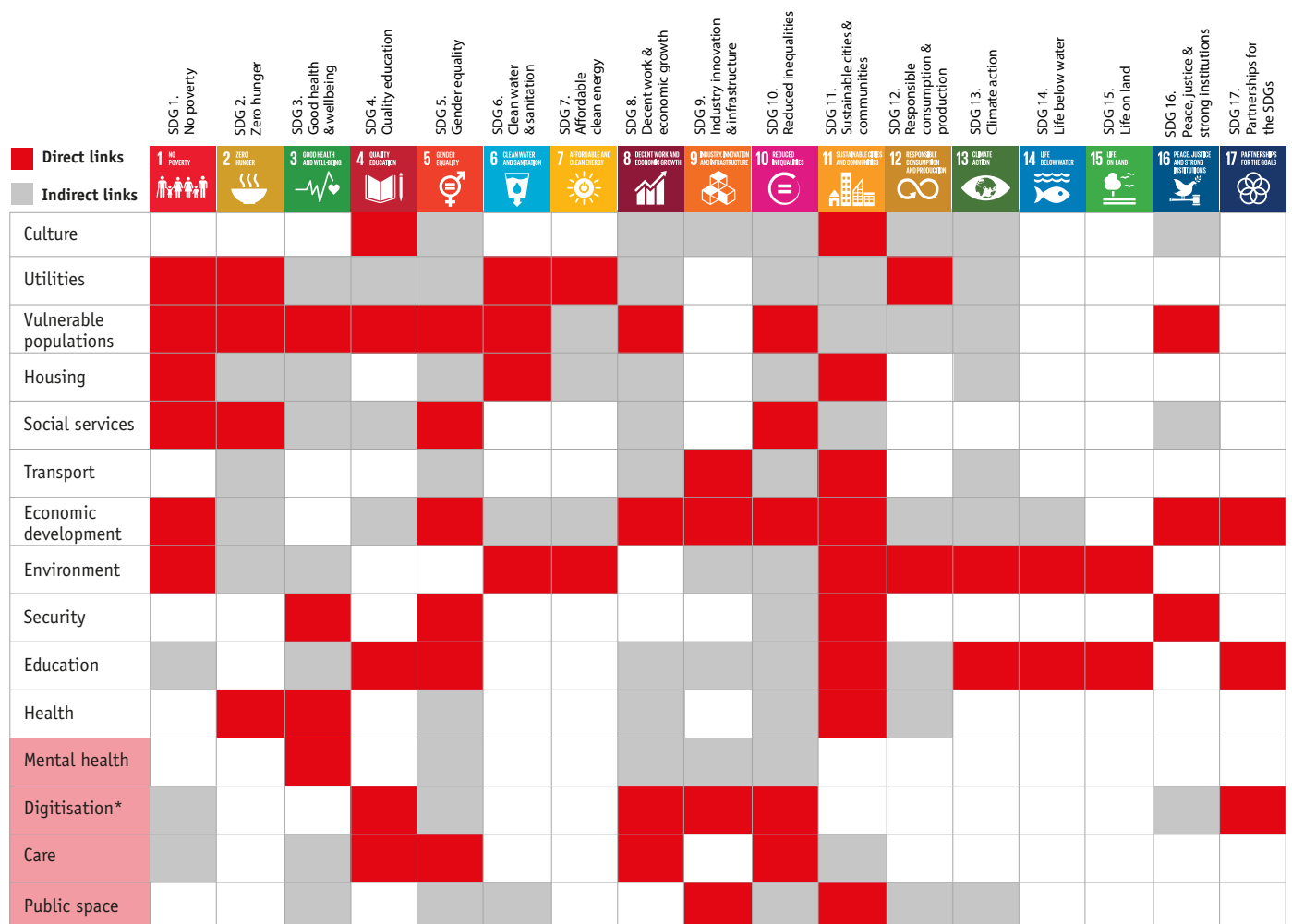
Figure 6: Links between search terms (see Appendix) and the targets of the global SDGs

It is critical that national governments and the international community acknowledge the links between local public service provision, complex emergencies, and the global agendas ; and that in response, they improve the coordination frameworks and mechanisms between levels of government and other stakeholders such as Voluntary National Reviews and national coordination units for SDG implementation, so that these incorporate synergies and concerns regarding local public service provision. We live in an age where emergencies are becoming ever more common and where local public services are key in both responding to and becoming more resilient to them – critical aspects to achieving global sustainability commitments.