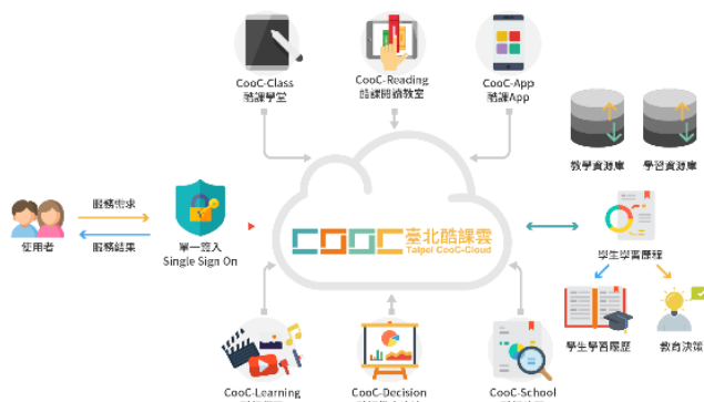
Figure 4: Taipei – CooC-Cloud

Following school closures due to lockdowns, the city of Taipei significantly improved its free, cloud-based learning system ‘CooC-Cloud’ which includes over 11,000 educational videos and over 300,000 e-books, covering contents from primary to high school levels . While the platform was first established