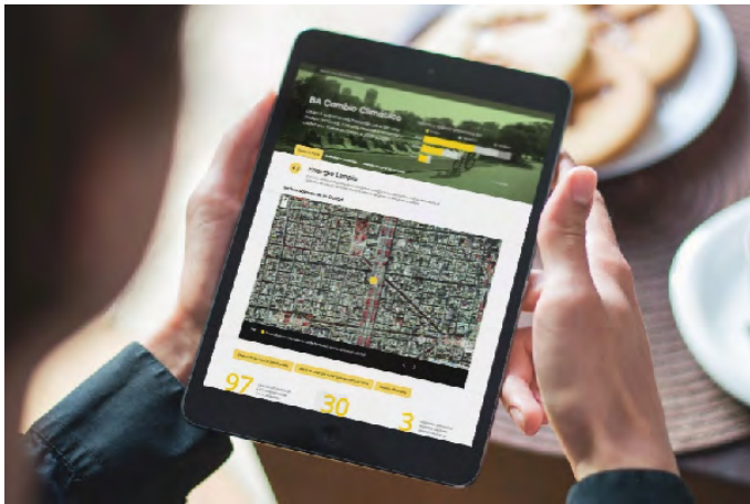
Figure 3: BA Climate Action